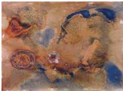
King Island 1 , 2008, by Dianne Blake.

The first exhibition is King Island, Bass Strait, 2008 by Dianne Blake. In this exhibition, Blake presents a series of paintings showcasing the pristine environment of King Island, Bass Strait. The paintings highlight the wonderful seascapes of the island and detail the many varieties of sea life which form delicate and intricate patterns. Using glue, pigment and oil wash on paper, Blake creates a series of textured surfaces and experiments with colour tones to evoke the swirling rock pools which at low tide reveals life below the surface.