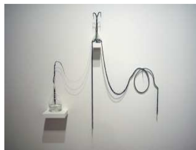
Transverse , 2005, by Jacqueline Groop

Helen Aitken-Kuhnen, a leading practitioner in metal, glass and enamelling presents a series of cast kiln lights. This series of sculptural forms introduce Aitken-Kuhnen's unique visual language, combining the elements of metal, glass and enamelling. These elements allow Aitken-Kuhnen to experiment with convex and raised surfaces and colour graduations.